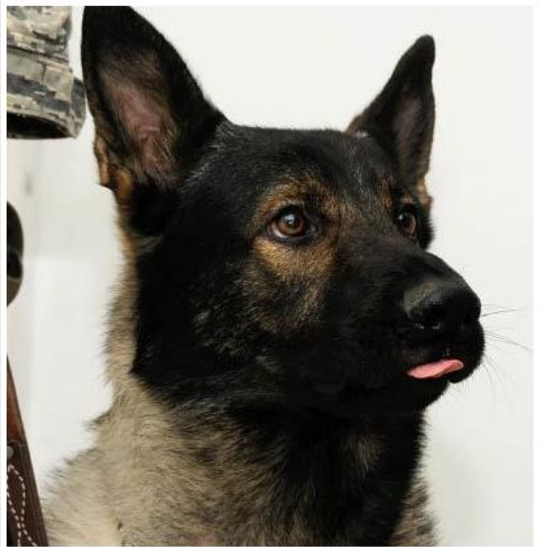
Carly the dog helps provide security for forces in Iraq.

SEAL dogs are outfitted with fearsome titanium chompers — at a cost of about $2,000 a tooth — which the Navy has done for years, he added. In addition to the sheer fear factor, their enhanced bite can pierce an enemy’s body armor.