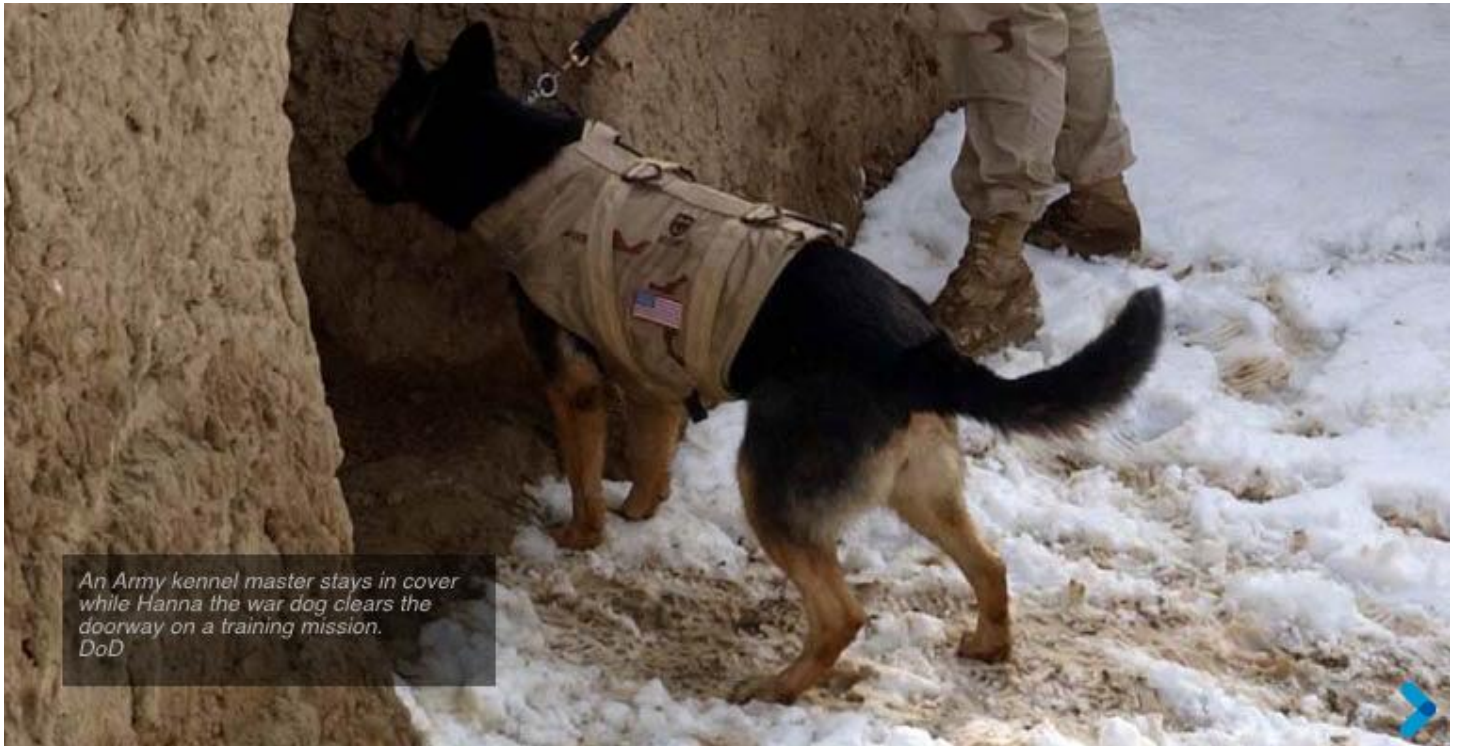
An Army kennel master stays in cover while Hanna the war dog clears the doorway on a training mission.